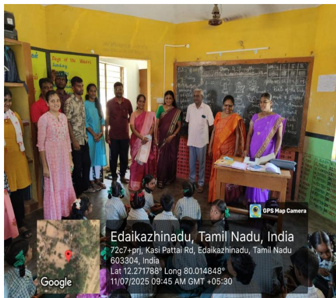
Edaikazhinadu, Tamil Nadu, India 72c7+prj, Kasi Pattai Rd, Edaikazhinadu, Tamil Nadu 603304, India Lat 12.271788° Long 80.014848° 11/07/2025 09:45 AM GMT +05:30