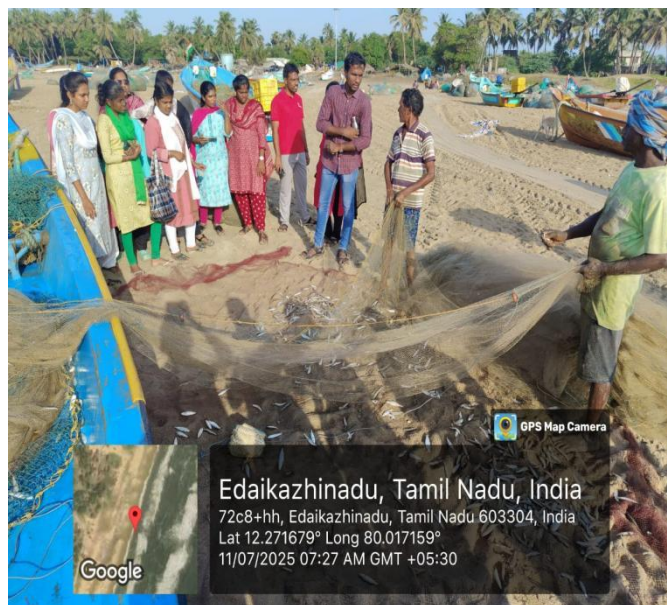
Edaikazhinadu, Tamil Nadu, India 72c8+hh, Edaikazhinadu, Tamil Nadu 603304, India Lat 12.271679° Long 80.017159° 11/07/2025 07:27 AM GMT +05:30