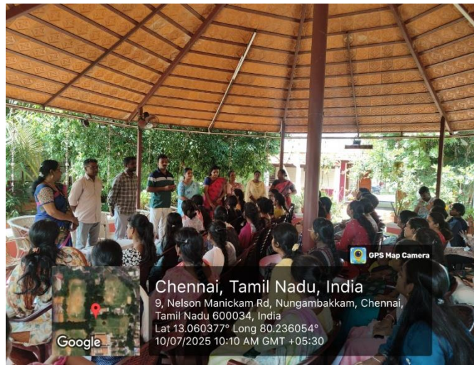
Chennai, Tamil Nadu, India 9, Nelson Manickam Rd, Nungambakkam, Chennai, Tamil Nadu 600034, India Lat 13.060377° Long 80.236054° 10/07/2025 10:10 AM GMT +05:30