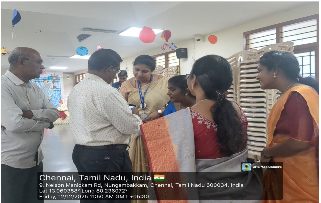
Chennai, Tamil Nadu, India 🇮🇳 9, Nelson Manickam Rd, Nungambakkam, Chennai, Tamil Nadu 600034, India Lat 13.060358° Long 80.236072° Friday, 12/12/2025 11:50 AM GMT +05:30