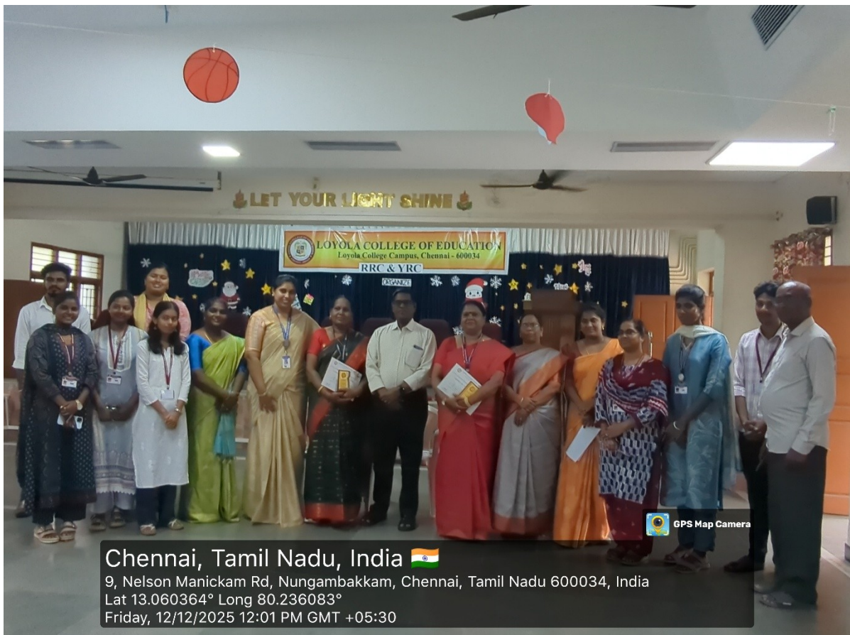
Chennai, Tamil Nadu, India 🇮🇳 9, Nelson Manickam Rd, Nungambakkam, Chennai, Tamil Nadu 600034, India Lat 13.060364° Long 80.236083° Friday, 12/12/2025 12:01 PM GMT +05:30