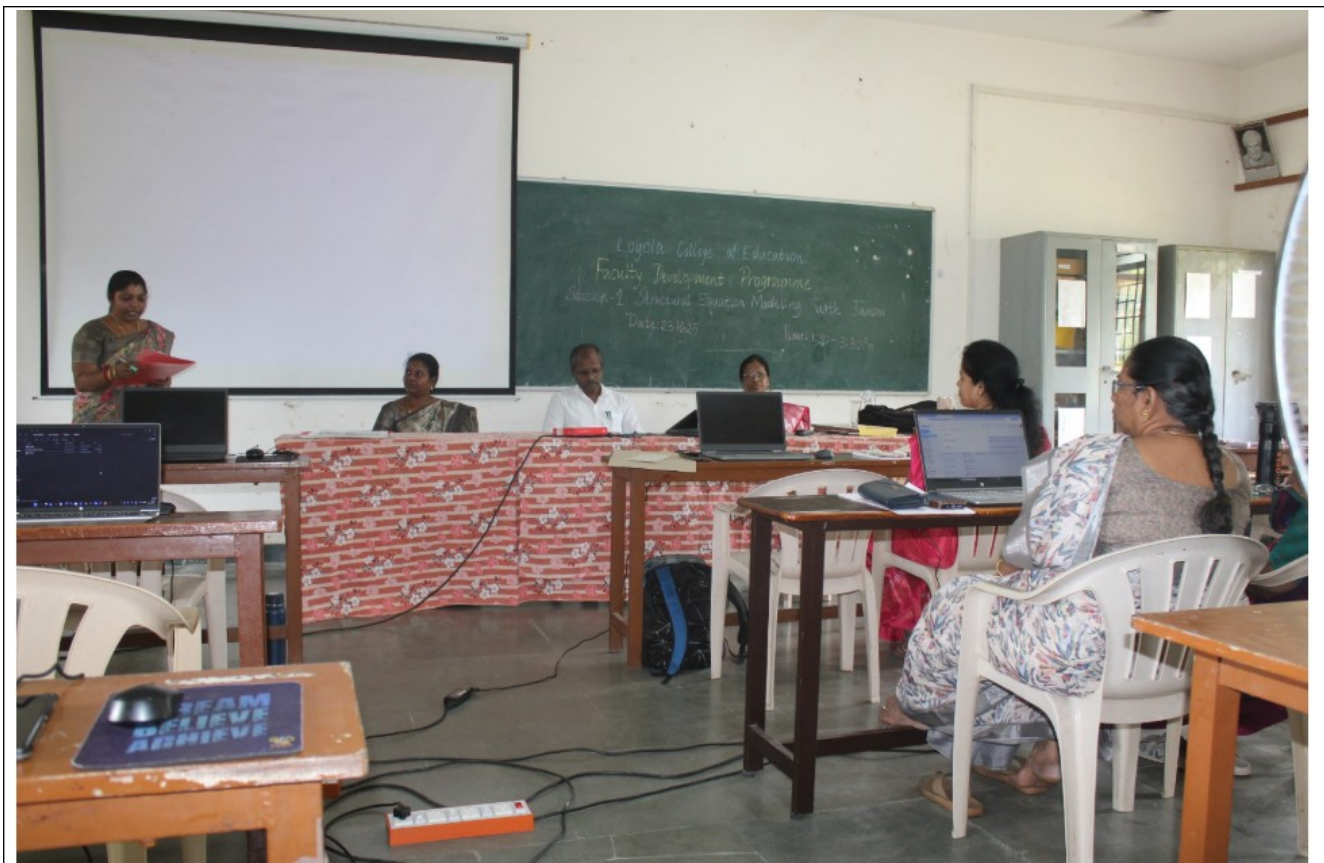
Honouring the resource person