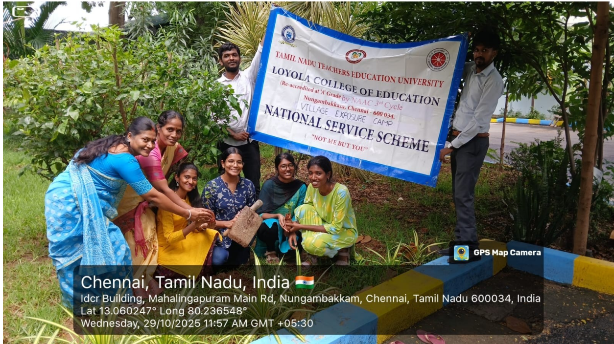
Chennai, Tamil Nadu, India 🇮🇳 Idcr Building, Mahalingapuram Main Rd, Nungambakkam, Chennai, Tamil Nadu 600034, India Lat 13.060247° Long 80.236548° Wednesday, 29/10/2025 11:57 AM GMT +05:30