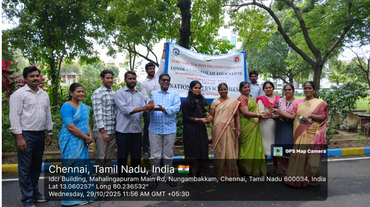
Chennai, Tamil Nadu, India 🇮🇳 Idcr Building, Mahalingapuram Main Rd, Nungambakkam, Chennai, Tamil Nadu 600034, India Lat 13.060257° Long 80.236532° Wednesday, 29/10/2025 11:56 AM GMT +05:30