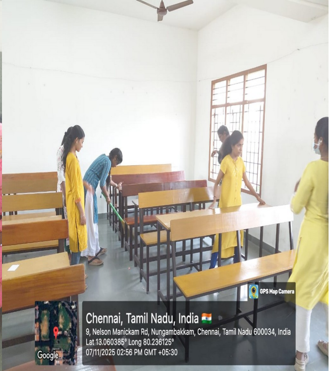
Chennai, Tamil Nadu, India 🇮🇳 9, Nelson Manickam Rd, Nungambakkam, Chennai, Tamil Nadu 600034, India Lat 13.060385° Long 80.236125° 07/11/2025 02:56 PM GMT +05:30