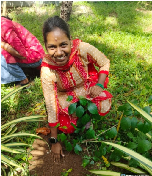
Chennai, Tamil Nadu, India 🇮🇳 9, Nelson Manickam Rd, Nungambakkam, Chennai, Tamil Nadu 600034, India Lat 13.060318° Long 80.236277° Wednesday, 29/10/2025 11:47 AM GMT +05:30