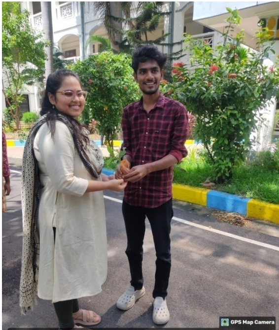
Chennai, Tamil Nadu, India 🇮🇳 9, Nelson Manickam Rd, Nungambakkam, Chennai, Tamil Nadu 600034, India Lat 13.060238° Long 80.236131° Wednesday, 29/10/2025 11:47 AM GMT +05:30