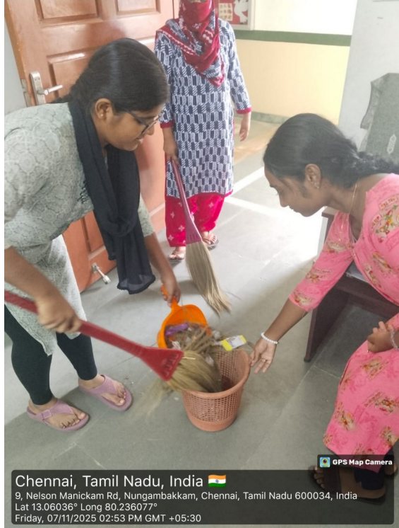
Chennai, Tamil Nadu, India 🇮🇳 9, Nelson Manickam Rd, Nungambakkam, Chennai, Tamil Nadu 600034, India Lat 13.06036° Long 80.236077° Friday, 07/11/2025 02:53 PM GMT +05:30