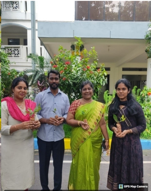
Chennai, Tamil Nadu, India 🇮🇳 9, Nelson Manickam Rd, Nungambakkam, Chennai, Tamil Nadu 600034, India Lat 13.060242° Long 80.236151° Wednesday, 29/10/2025 11:40 AM GMT +05:30