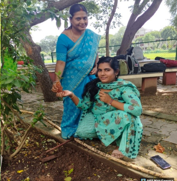
Chennai, Tamil Nadu, India 🇮🇳 9, Nelson Manickam Rd, Nungambakkam, Chennai, Tamil Nadu 600034, India Lat 13.060176° Long 80.236242° Wednesday, 29/10/2025 11:46 AM GMT +05:30